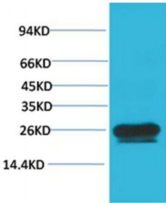
Western blot analysis of Hela with HSP27 Mouse mAb diluted at 1:2,000