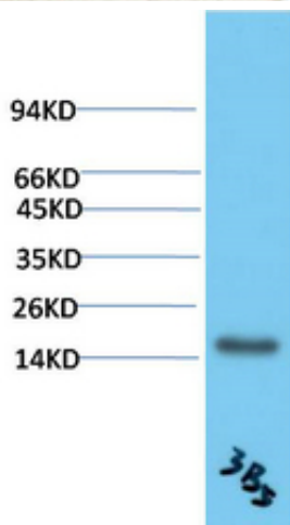
Western blot analysis of Human Serum using TTR Mouse mAb diluted at 1:2000