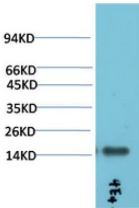
Western blot analysis of Human Serum using TTR Mouse mAb diluted at 1:2000