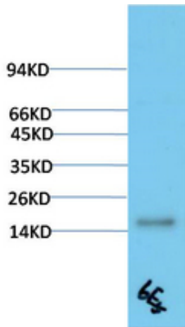
Western blot analysis of Human Serum using TTR Mouse mAb diluted at 1:2000