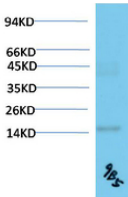
Western blot analysis of Human Serum using TTR Mouse mAb diluted at 1:2000