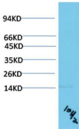
Western blot analysis of Human Serum using TTR Mouse mAb diluted at 1:2000