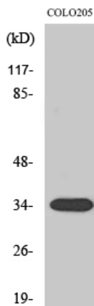
Western Blot analysis of various cells using Calponin 2 Polyclonal Antibody