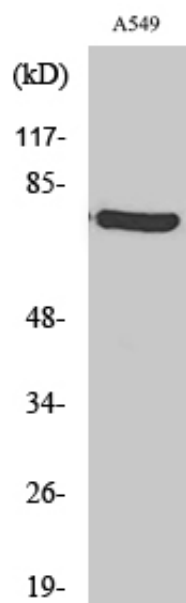
Western Blot analysis of A549 cells using PBFE Polyclonal Antibody